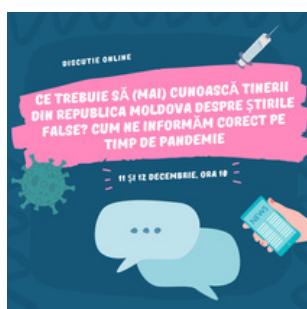
What (else) should Moldovan youth learn about fake news? How to navigate safely online amid COVID-19 pandemic