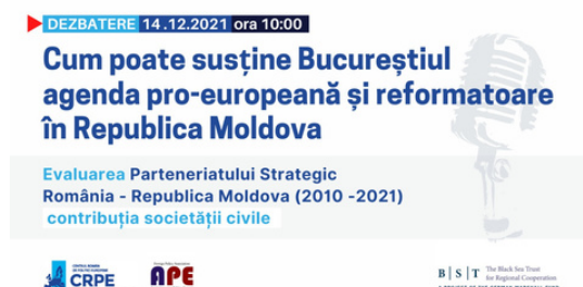
How Bucharest can support the pro-European and reformist agenda in the Republic of Moldova