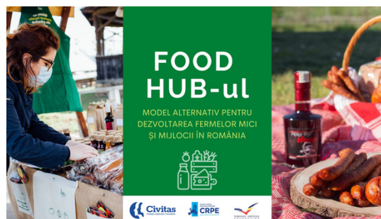
FoodHub: An alternative development model for small and medium farms in Romania