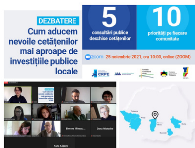
Bringing citizens' needs closer to local public investments